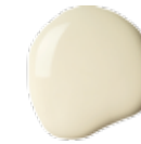
Exterior: 7006-1 Homestead Resort Jefferson White

LP SmartSide is one of the fastest growing brands of exterior siding in America due to exceptional beauty and durability. The exterior of the cottage features LP SmartSide lap, trim and soffit.